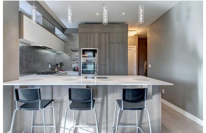
308-119 19 St NW, Calgary, AB

Welcome to Savoy by Truman Homes, where urban convenience meets contemporary style! Nestled in the heart of Kensington West, this vibrant community offers an incredible lifestyle—step outside to explore charming boutique shops, restaurants, bistros, and delis. Enjoy easy access to transit, the Bow River pathways, Kensington Village, and downtown, plus a well-established neighborhood with schools, parks, playgrounds, and more! This bright and unique corner unit boasts south east-facing exposures, flooding your space with natural light. Step into a welcoming entryway with a closet, leading you to a sleek, modern kitchen featuring high-end appliances, quartz countertops, and custom cabinets. The open layout flows effortlessly into the dining and living areas, the perfect spot to relax, with access to the south-facing balcony. The spacious primary bedroom features a luxury ensuite pampering you with a deep soaker tub, a large standing shower, and a stunning Kohler glass vessel sink. The flexible second bedroom is thoughtfully placed on the other side of the unit for added privacy. The spa-inspired main bathroom includes a huge walk-in shower and stylish glass vessel sink. Plus, the in-suite laundry offers additional storage and organization. Enjoy the added perks of a rooftop patio, secure titled underground parking, a separate storage locker, and bicycle storage. This stunning home is move-in ready—come experience the best of Kensington living today!