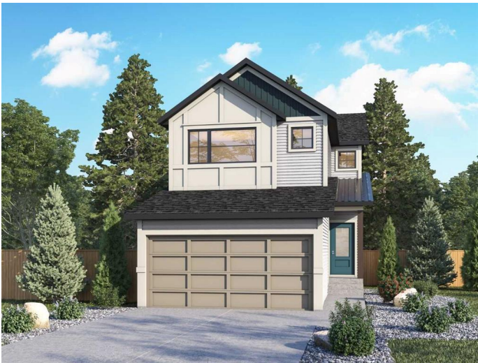
56 Fireside Common

Introducing the Montay by Genesis Builder Group—a thoughtfully designed two-story home featuring 4 spacious bedrooms and 2.5 bathrooms. With a striking open-to-above foyer, this home welcomes you into an open-concept main floor that blends style and functionality. The great room offers a cozy fireplace with a mantle, perfect for relaxing evenings, while the kitchen impresses with a central island ideal for entertaining. A sleek railing guides you to the upper floor, where you™ll find a versatile bonus room and the convenience of an upstairs laundry. The home also includes a double attached garage, 9-foot basement ceilings, a side entry, and basement rough-ins, offering incredible potential for future development. Photos are representative.