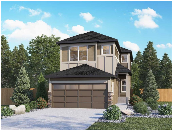
60 Fireside Common

Welcome to the Capri by Genesis Builder Group – a stunning two-story home designed for modern living. This spacious 4-bedroom, 3-bathroom layout features an open-concept main floor with a stylish kitchen island, elegant railing details, and a cozy fireplace with a mantle as the living room centerpiece. Thoughtfully designed for flexibility, the main floor includes a full bedroom and bath, perfect for guests.. Upstairs, you’ll find a bright bonus room, convenient laundry area, and additional bedrooms. Enjoy a double attached garage, 9-foot ceilings in the basement, side entry, and rough-ins ready for potential future basement development – offering endless potential to make this home truly yours. Photos are representative.